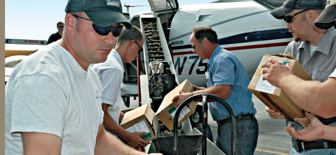
Aerial drops of ORV baits are the most cost-effective way to distribute vaccine in rural areas. Here, WS employees load baits onto a fixed-wing aircraft.