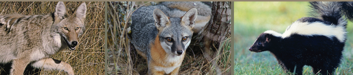
Pictured are some of the wildlife species that commonly spread rabies—coyote, fox, and skunk.

WS established its National Rabies Management Program in recognition of the changing scope of rabies. The program aims to prevent the further spread of rabies by containing the raccoon variant and, eventually, to eliminate terrestrial rabies in the United States through an integrated program involving the use of oral rabies vaccination (ORV) of wildlife.